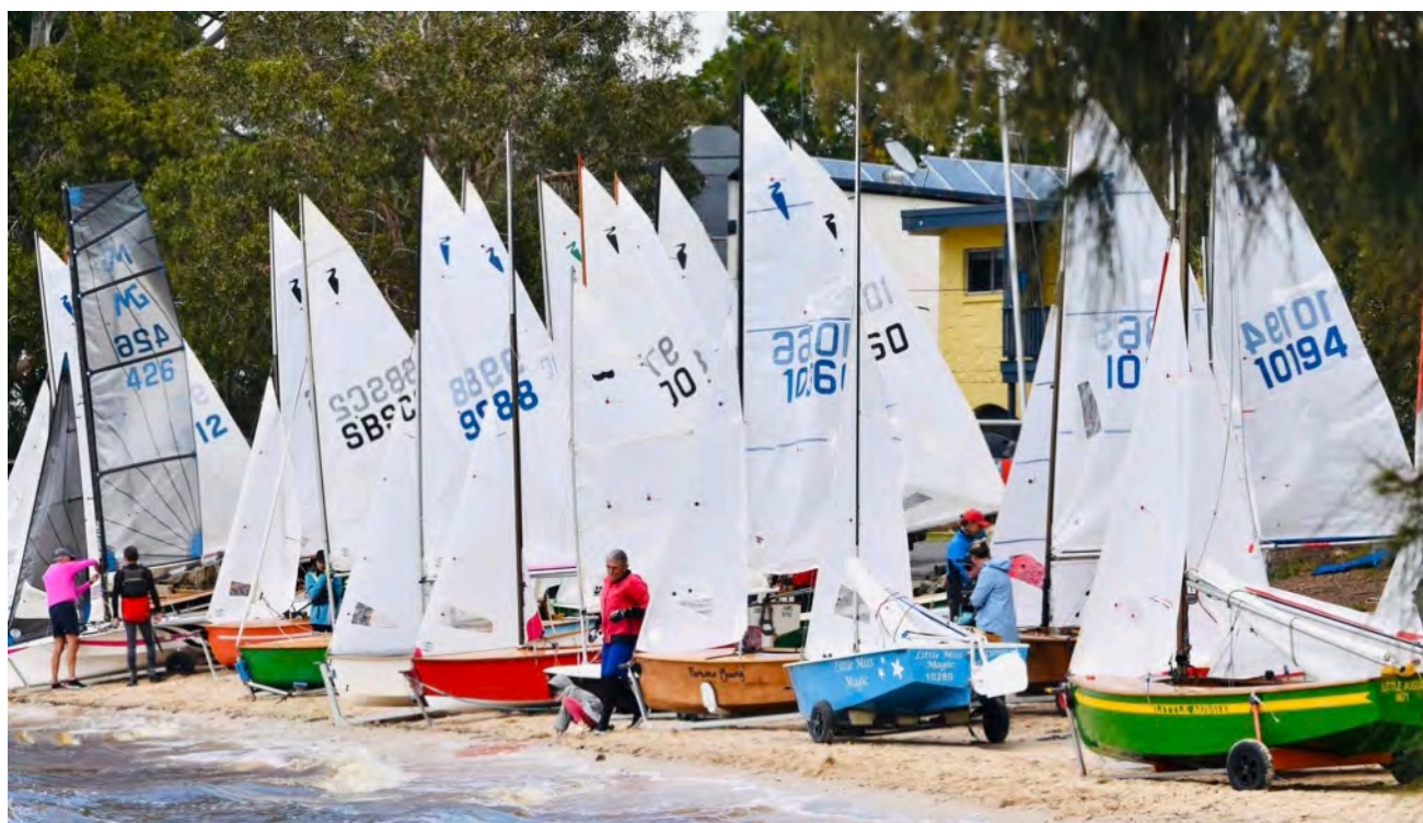
Herons on the beach at the 2025 Jack Holt Regatta at Lake Cootharaba