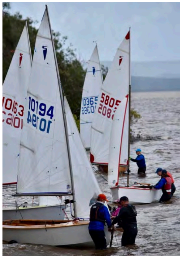
Ready to race at the 2025 Jack Holt Regatta

We acknowledge the traditional owners and custodians of the lands on which we walk and waters on which we sail. We recognise their continuing connection to the land, water, culture and community.