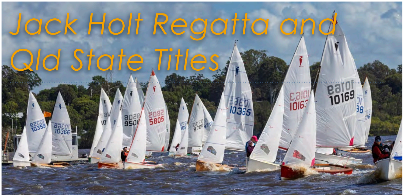
2025 Jack Holt Regatta, Lake Cootharaba