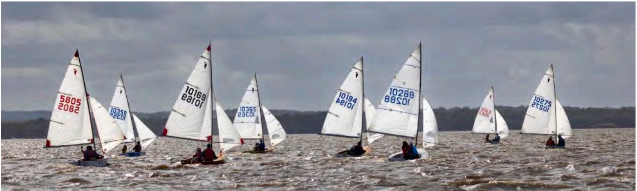
Jack Holt Regatta 2025, Lake Cootharaba Queensland.